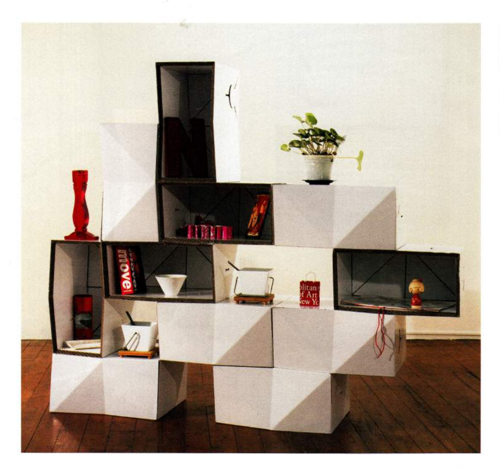
If you like the sound of Kirsty Mate's idea for cardboard kitchen shelving, you may want to investigate the Freefold series (www.freefoldfurniture.com). Made from 97% post-consumer wastepaper cardboard, the flat-pack system can be assembled into kitchen shelves, then disassembled and reassembled as your needs change, or recycled. RRP $88 per module (the freestanding unit pictured is 11 modules).