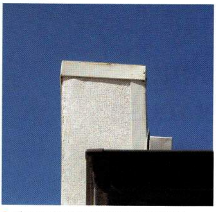
The parapet cap sheds moisture away from the walls.

They've put in a false ceiling to hide the trusses and provide a deep cavity to keep insulation clear of the recessed downlights. They've used LED downlights from