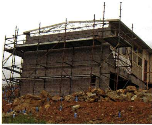
The blockwork going on one of the portables, with foil insulation underneath.

The block cladding creates a cavity for insulation. The 100 mm cavity between wall and portable holds a 75 mm R1.8 glass insulation blanket with a reflective surface to the exterior. The radiant barrier reflects heat rather than acting as a conductor, and thus reduces the influence from extreme temperatures. Its use requires an adequate air space (25 mm in this case) and placement is dependent on climate. Bulk R2.0 Green Batts have also been placed in the 90 mm cavity of the portables' timber-framed walls.