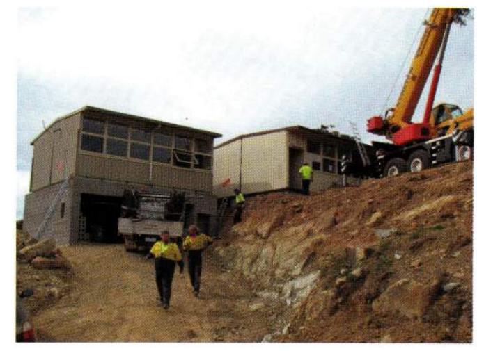
Half a portable being craned into position (above), and the two portables installed (right).

They sourced the portables from BRB Modular nearby in Kyneton; you can see the field of portables as you drive along the Calder Freeway towards Chewton. BRB specialises in modular construction and also provides second-hand schoolroom portables for use in schools and temporary buildings—and builds such as Andy's.