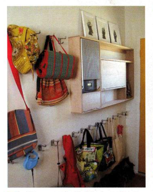
↑ The PV system monitor is built-in—in a cupboard in the entry hall—with the hooks below it reused from the portable classrooms. The 2kW PV system is generating around 10–14kWh in October, against usage of about 5–6kWh for this all-electric house (usage will be higher in winter with heater use).