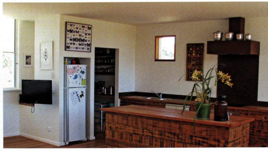
Cross-sawn timber kitchen cupboards and the recycled oregon timber benchtop are a feature of the open-plan kitchen/living space—along with just a small fridge space.

"The lime render changes colour according to the light; in the moonlight, Andy says, it glows a soft purple."