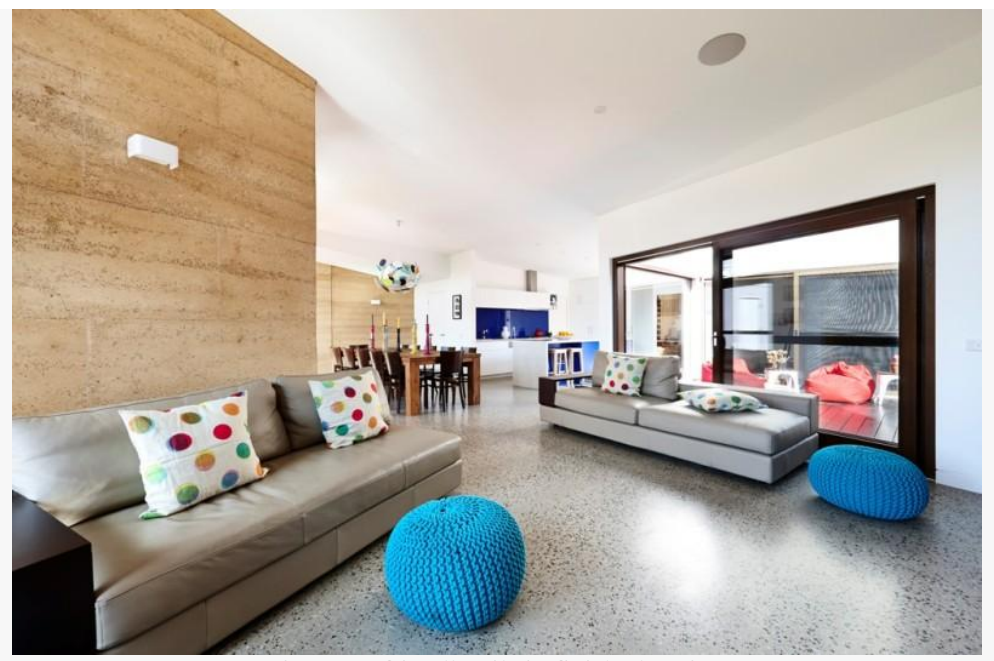
Livos eco friendly oils in finished project

Not only are these products suitable for the professional, but also not difficult to use for the hobbyist or DIYer. Also and largely due to demand, we have introduced a range of safe face and finger paints for kids.