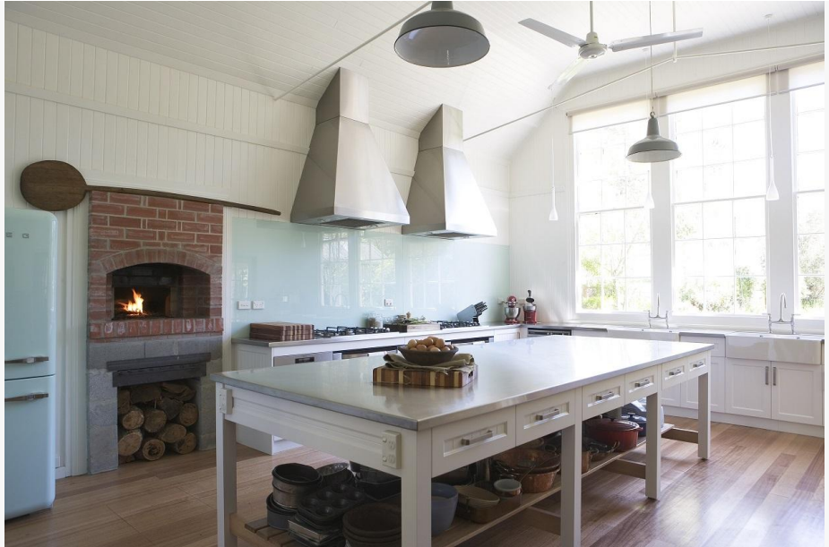
Livos eco friendly products in a finished project

You offer a wide range of products from floor finishes, to paints, even children's finger paints! Can you tell us some more about the various product ranges Livos offers?