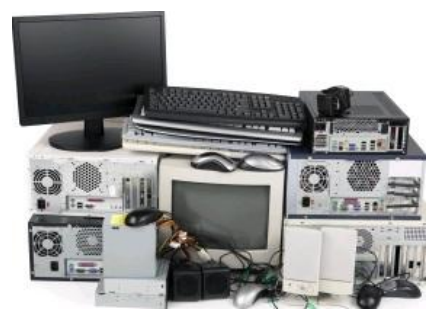
Shared from eco specifer newsletter