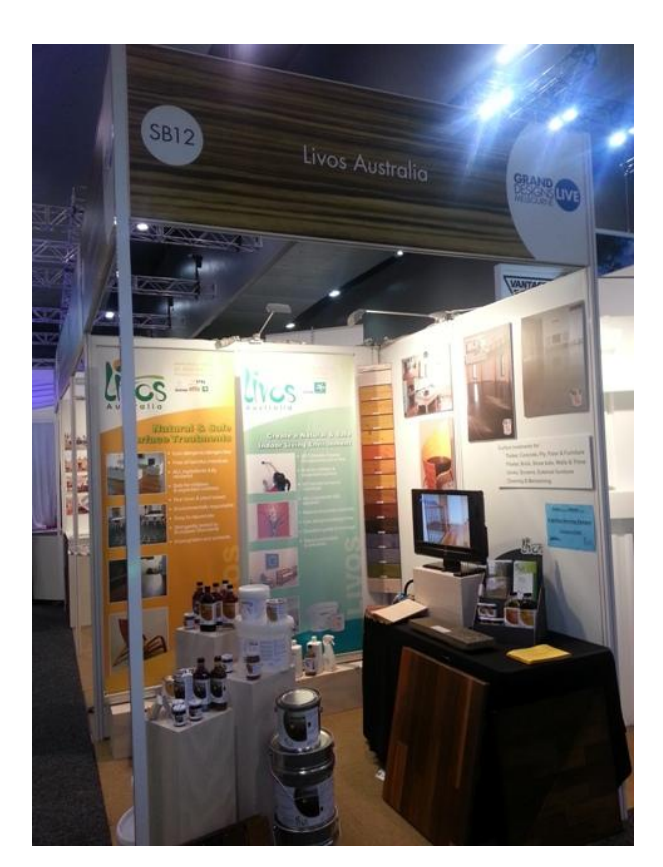
Maxa designs stand had compressed straw treated with the Kunos and Vindo

It was fantastic being a part of the second Grand Designs Live expo in Melbourne, especially humbling 2 other exhibitors used the Livos products in their displays.