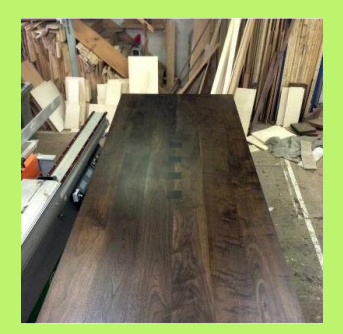
Table by Anton Gerner picture from

Later, rejuvenation with a clear oil is quick and easy to do, with no feathering in necessary.