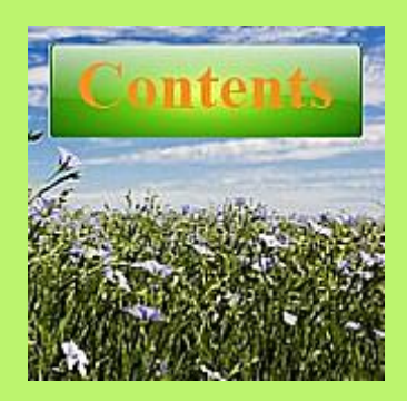
Livos Australia February Newsletter