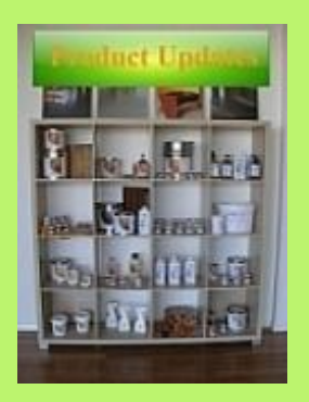
LIVOS Australia Website: TDS updates, Videos and Hints and Tips Info

The ease of painting with the Livos paints. By a DIY hobbist with nothing better to do on a few days off....Guess who?