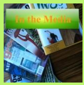
IN THE MEDIA

http://www.facebook.com/LivosAust?ref=hl#!/AntonGernerFurniture?fref=ts