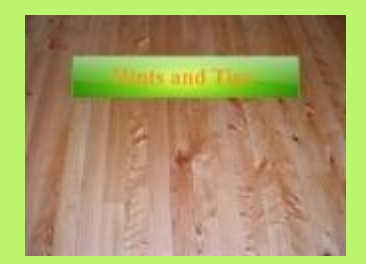
HINTS and TIPS