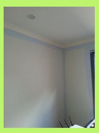
2. Cutting in with no tape gives one the time to concentrate on the task at hand.

1. Having had a large hole in the plaster wall caused by moving furniture, the area was repaired and primed.