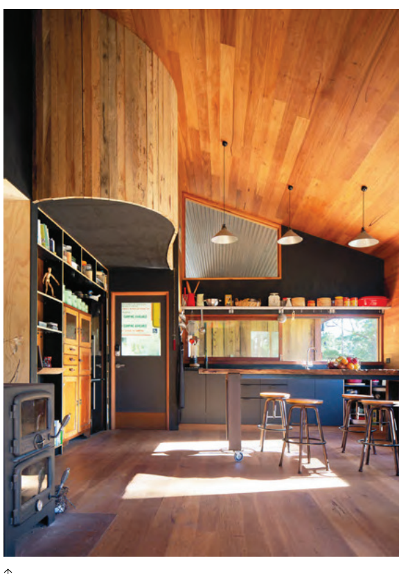
The curved wall of the loft above the kitchen is clad with rough-sawn timber for a tactile, cabin-like feel.

wall there is a surfboard rack, basin and semi-outdoor shower, making it easy after a surf.