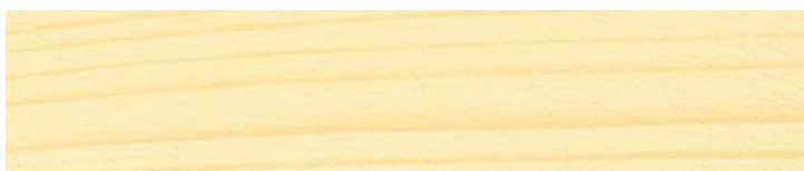
1 x 204 weiß, white, blanc, blanco, bianco, hvit