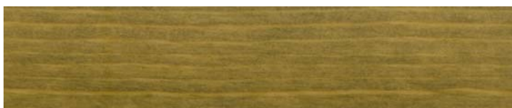
2x 089 eiche-antik, antique oak, chêne ancien, roble antiguo, quercia antica, eik antikk