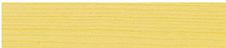
2 x 002 farblos, colourless, incolore, incoloro, incolore, fargeløs