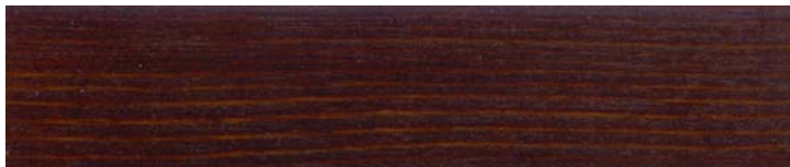
2 x 064 walnuß, dark walnut, noyer foncé, nuez, noce scuro, valnøtt

Due to typographical differences, the color tones can be different from the original.