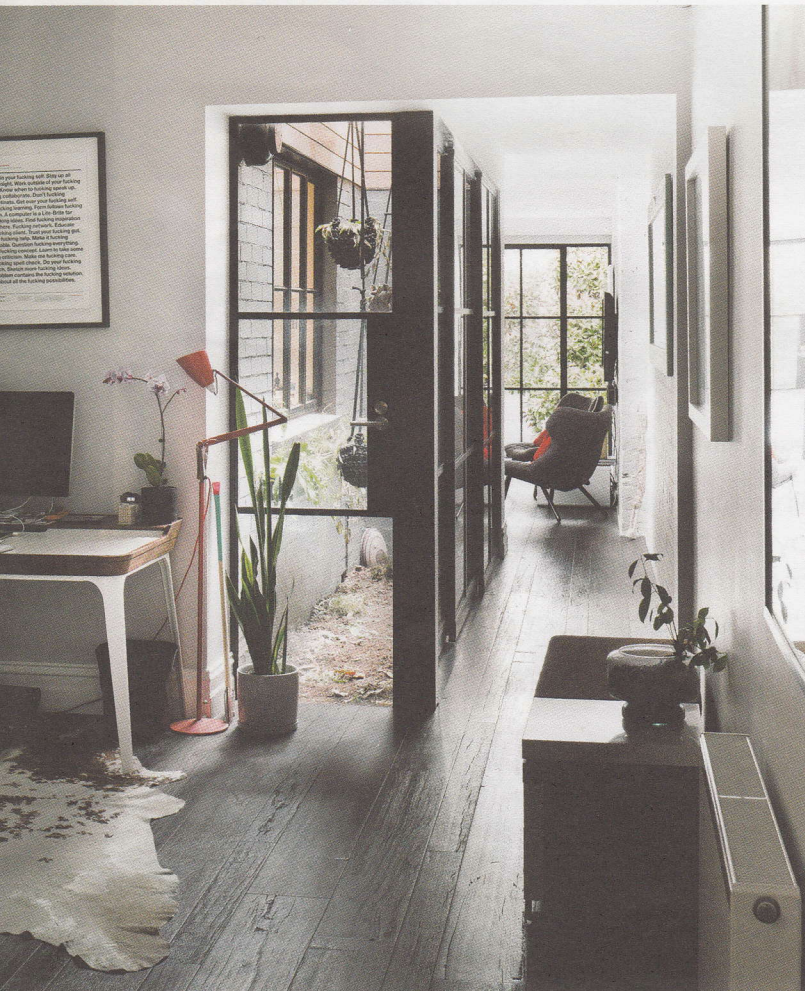
top left The rear courtyard lost no space to the renovation, which was resolved within the original footprint. right A study nook is tucked into the extra bit of hallway created through the installation of the vertical courtyard. bottom left Main study next to the yet to be planted courtyard. right Sculptural, hardy plants proved to be the most successful in the enclosed garden.