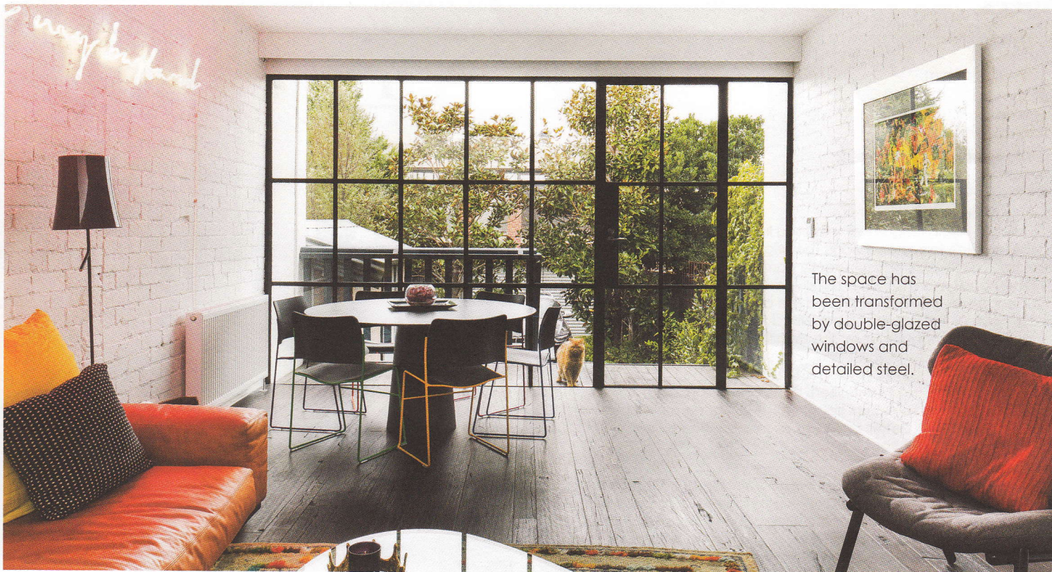
The space has been transformed by double-glazed windows and detailed steel.

Terraces, such as this, line the streets of inner Melbourne and often do an exceptional job of hiding their insides. Strict planning regulations mean that architects must cleverly renovate while not revealing even a hint of change from the exterior. This particular Victorian in Melbourne's inner north suffered not just from a dated mish-mash of alterations but simply from being "the man in the middle", sandwiched on an east-west block.