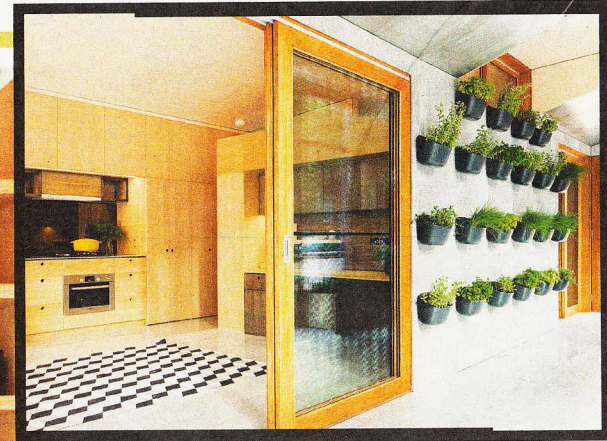
Stylish and eco-wise design in the Carbon Positive Home (pictured main, above right and far right)

"We've put a lot of thought into the design to make the house as useful and practical as possible using the smallest footprint," Bill explains. "We worked a lot on the minimisation of circulation – or passageways – in the house, which can unnecessarily take up to 25 per cent of a home's footprint. If you've got well-insulated walls and recesses off the main living areas to give a sense of privacy, you don't need long passageways in a house, which is just extra space that you need to heat, cool and manufacture."