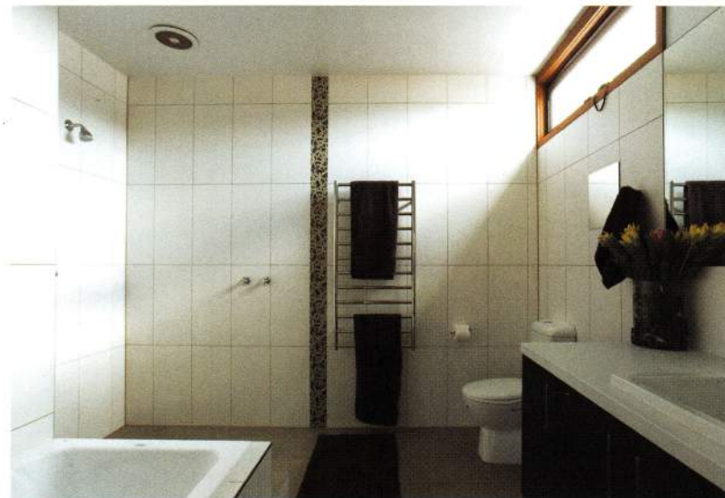
➔ Wide span tiles combined with dark grout were chosen for low maintenance cleaning and longevity. The exhaust fan was fitted with a Draft-Stoppa duct vent to minimise heat loss. Kelly and John bucked current trends and opted for a single basin.