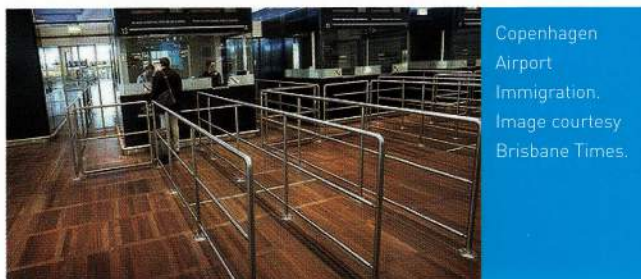
Copenhagen Airport Immigration.