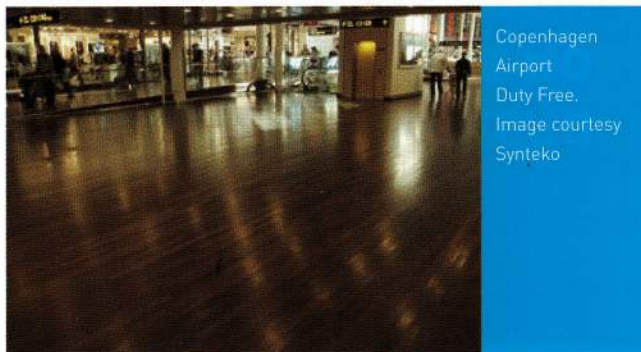
Copenhagen Airport Duty Free.