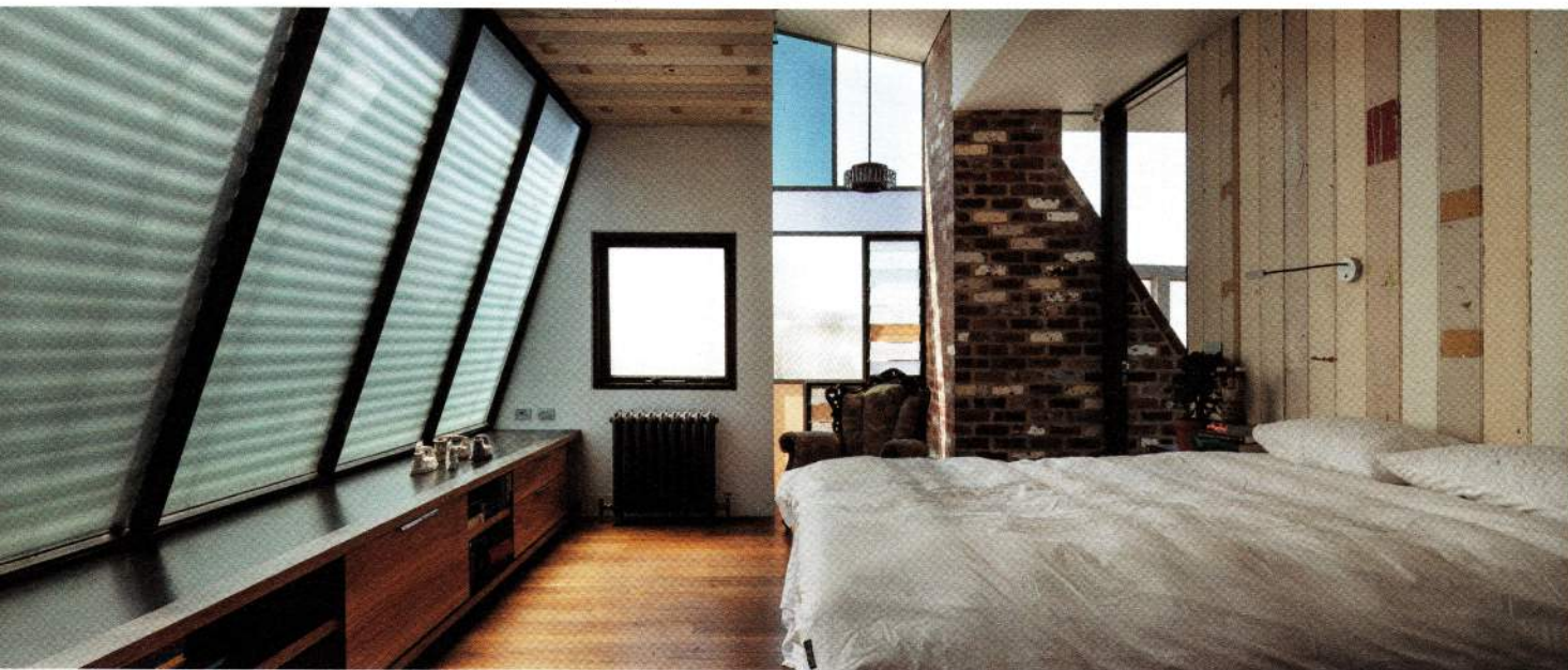
The raked glazing, recycled bricks and timber panelling give the main bedroom its New York-meets-hippy aesthetic. opposite page top left The "conversation pit" with exposed brickwork and panelled roofing is a nod to the architectural vernacular of the late '60s and '70s. right This whimsical "Juliet balcony" is a charming feature of the first floor. bottom left The study is a peaceful haven that allow views to the rest of the house. right The honed bluestone flooring leads to the entry with its kaleidoscope of light and colour.

Originally from Geelong in Victoria, the client had always dreamed of living in a warehouse. She was keen to collaborate with building designer Ian Wilson to design a home that would have an industrial sensibility, so when she found this site it was also a nod to the industrial building types typical of many inner suburbs of Melbourne.